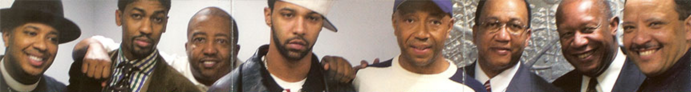
REVEREND RUN FARNSWORTH BENTLEY KEVIN LILES JOE BUDDEN RUSSELL SIMMONS BEN CHAVIS HOWARD DODSON MARC MORIAL