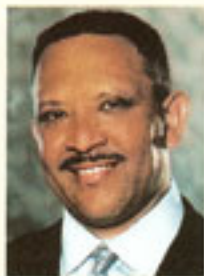
Marc Morial, President National Urban League

Hip-Hop Reader is a youth literacy and leadership program designed to enhance the reading interest, technology usage, and civic engagement of urban high school students.